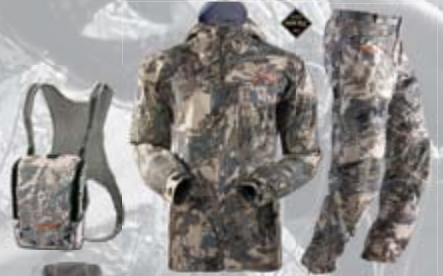
STORMFRONT LITE RAINGEAR, FOR THE 'FAST & LIGHT' HUNTER