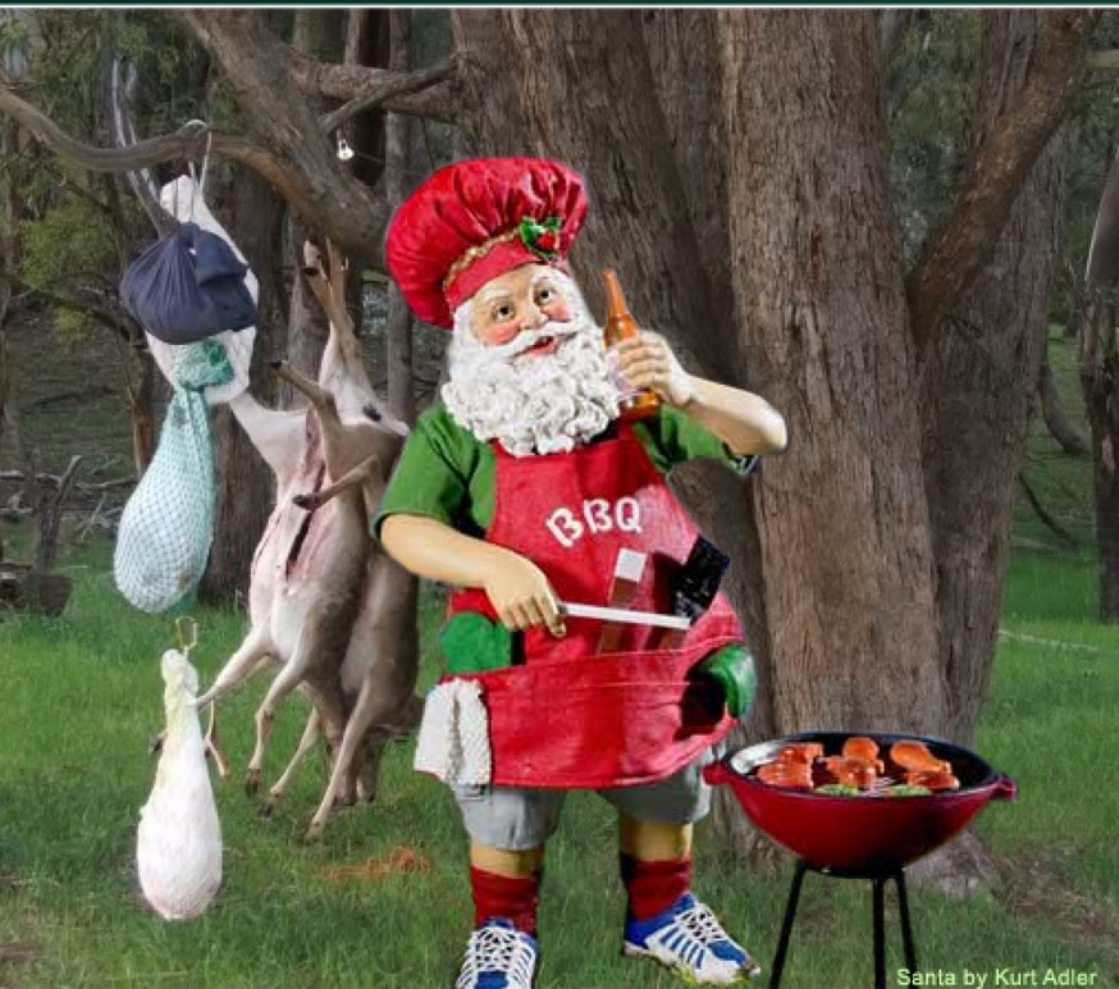
Santa by Kurt Adler

Wishing your family all the best for the festive season. Thanks for your support this year and we look forward to seeing you back in 2012.