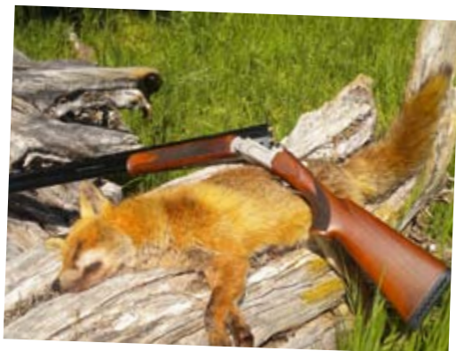
Fox stuff - by Dantheman253