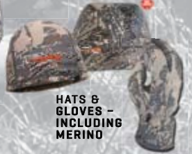
HATS & GLOVES - INCLUDING MERINO

Now Available in New Zealand at The Safari Supply Company www.safarisupply.co.nz/sitka