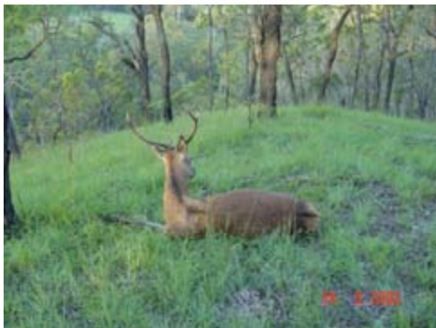
What was that - by Gregk