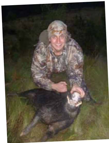
Wollondilly Oct 2011 - by Zubtec