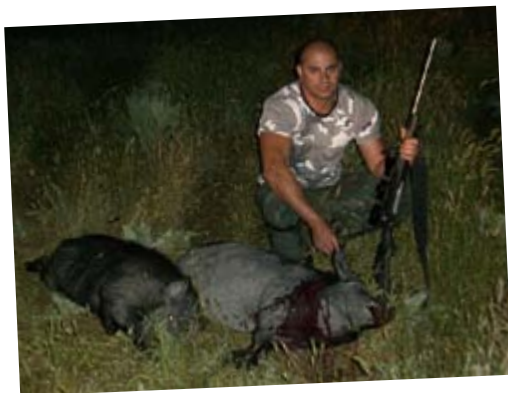
Pigs - by MR243