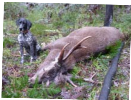
Bella n stag - by No I Deer