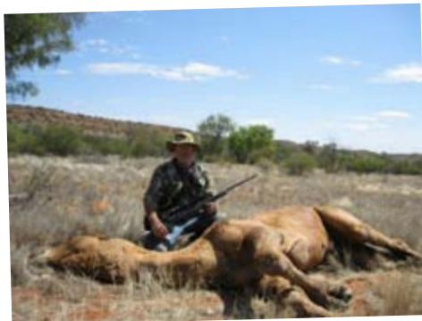
Camel - by Doug

To see many more images and comments check out the member's gallery .