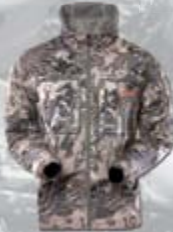
BE SURE TO CHECK OUT THE WINDSHIRT & BINO BIVY