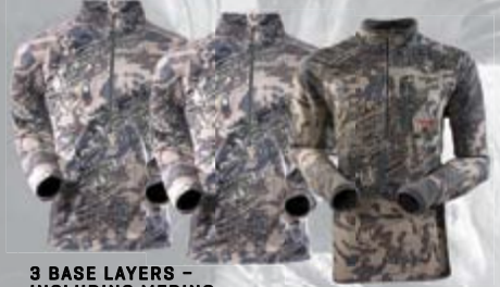
3 BASE LAYERS - INCLUDING MERINO

SITKA OPEN COUNTRY SYSTEMS: GO FARTHER. STAY LONGER. GET CLOSER.